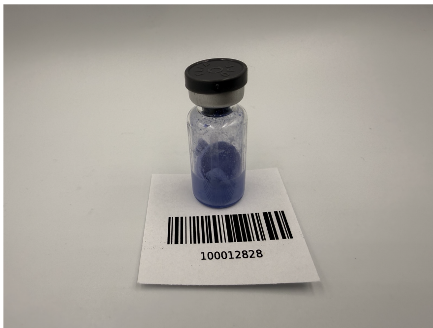
Photo of the test sample

The test sample was applied in the amount of 3 \mu l to the BioBasic 8 Thermo Scientific column. During the course of the analysis with the method a linear gradient in the solutions of H 2 O and Acetonitrile with the addition of 0.1% trifluoroacetic acid, a peak of the sought substance appeared. Its content, when compared to the reference chromatogram, is 51,82mg. Height the measurement error is + - 0,05mg. The actual state of the sample sent before the test is presented on the photo below